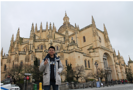
Fig. 1.1 Segovia

After settling down, I went to Segovia and Cuenca for day trips. Segovia is famous for its historical buildings and it only takes around 1 hour from Madrid. After Segovia, we headed to Cuenca, also a beautiful city near Madrid, where you can enjoy the stunning natural scenery. I also went to Budapest and Bratislava at the end of January. Remember not to miss the thermal baths in Budapest as they were the best experience for the first month of my exchange!!