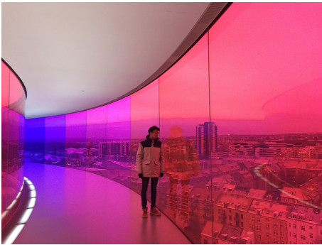
Fig. 5.2 Aarhus