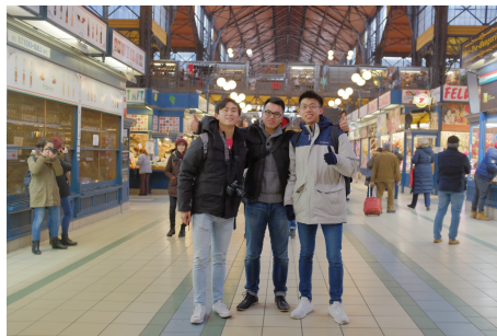
Fig. 3.2 Budapest