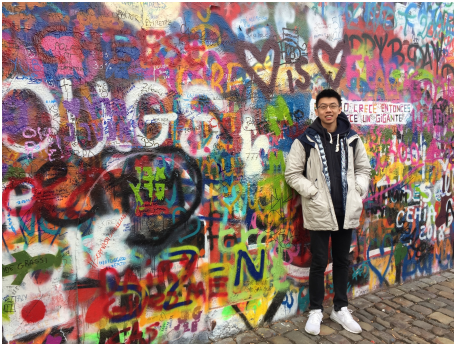
Fig. 9.1 Prague