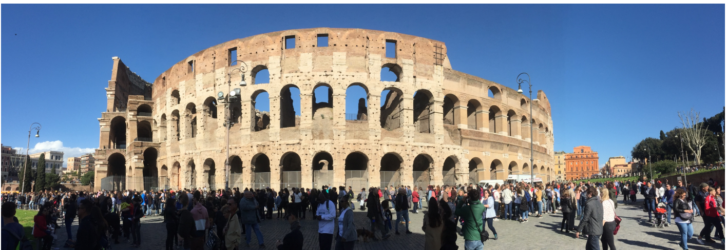
Fig. 15.2 Rome