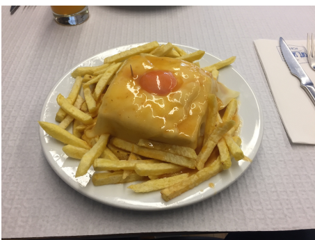
Fig. 7 Porto

I also had a really great time during the Easter break: Brussels, Paris, Zurich, Milan, Rome and Vatican. Things you must do: try the fries and waffle in Brussels, visit the Eiffel Tower in Paris, feel the city vibe in Zurich, go to the shopping center in Milan and experience the historical culture in Rome and Vatican.