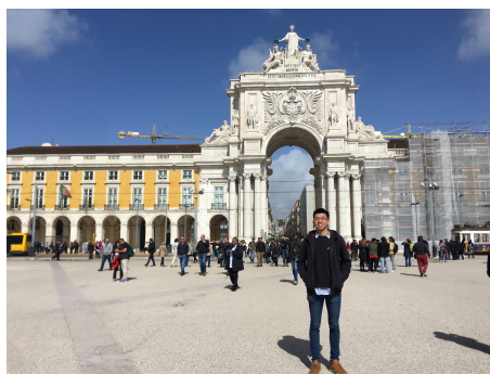
Fig. 8.1 Lisbon