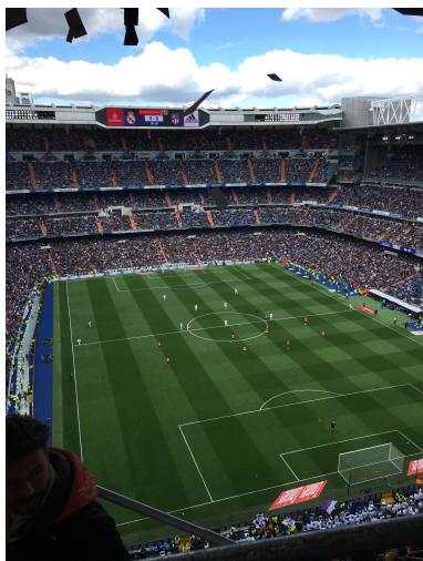
Fig. 17 The Madrid Derby

My classes all ended on April 20 and exams took part in the following week. Compared to UST, the course materials and the exams are relatively easy and that you should be fine for finishing them without lots of pressure.