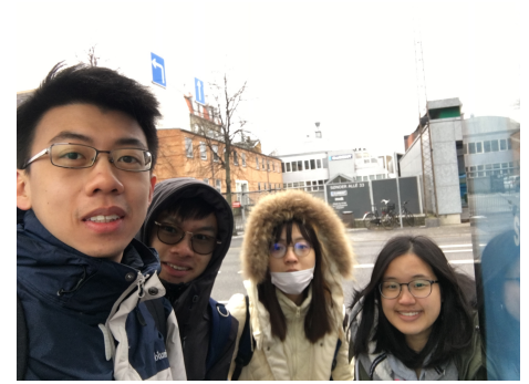
Fig. 5.1 Aarhus