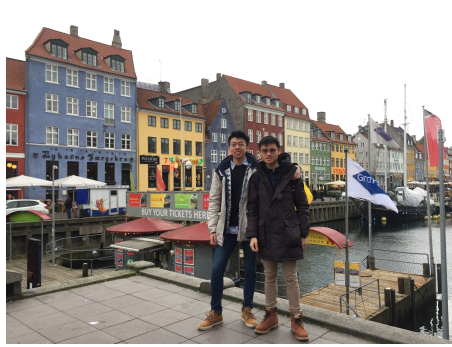
Fig. 4.2 Copenhagen