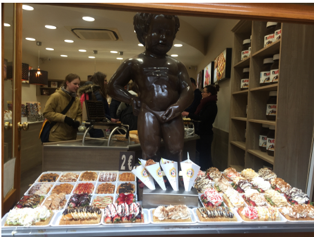
Fig. 11 Brussels