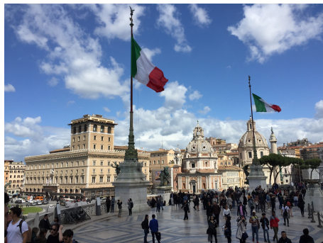
Fig. 15.1 Rome