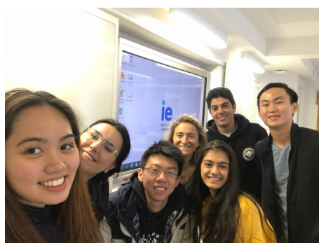
Fig. 18 Amigos en español 0.1