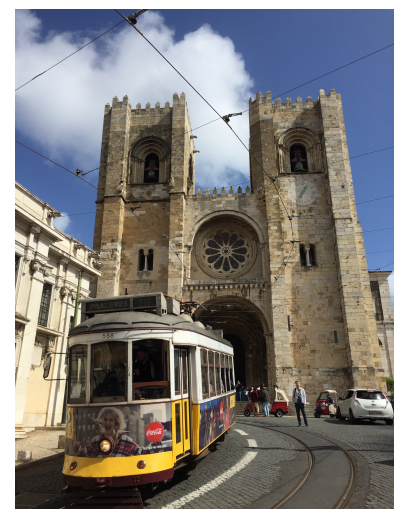
Fig. 8.2 Lisbon