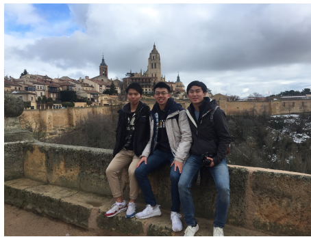
Fig. 1.2 Segovia