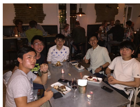
Fig. 19 Farewell