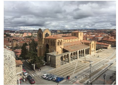
Fig. 6 Ávila