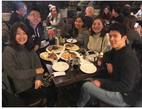
Fig. 9.2 Prague