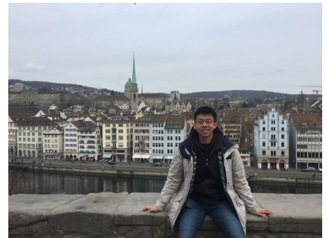
Fig. 13 Zurich