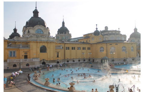
Fig. 3.3 Budapest