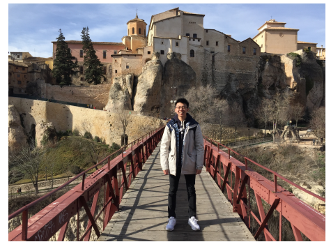
Fig. 2 Cuenca