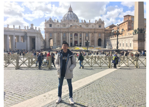
Fig. 16 Vatican