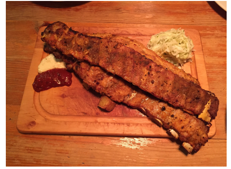
Fig. 10 Vienna