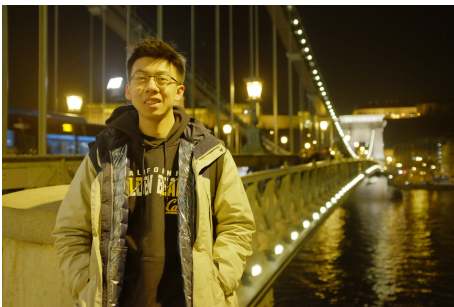
Fig. 3.1 Budapest