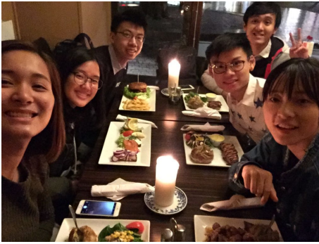
Fig. 4.1 Copenhagen