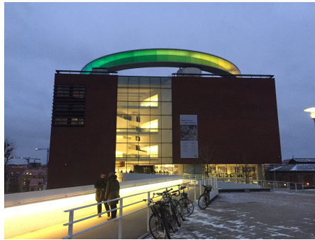
Fig. 5.3 Aarhus