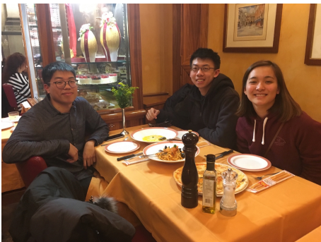
Fig. 14 Milan